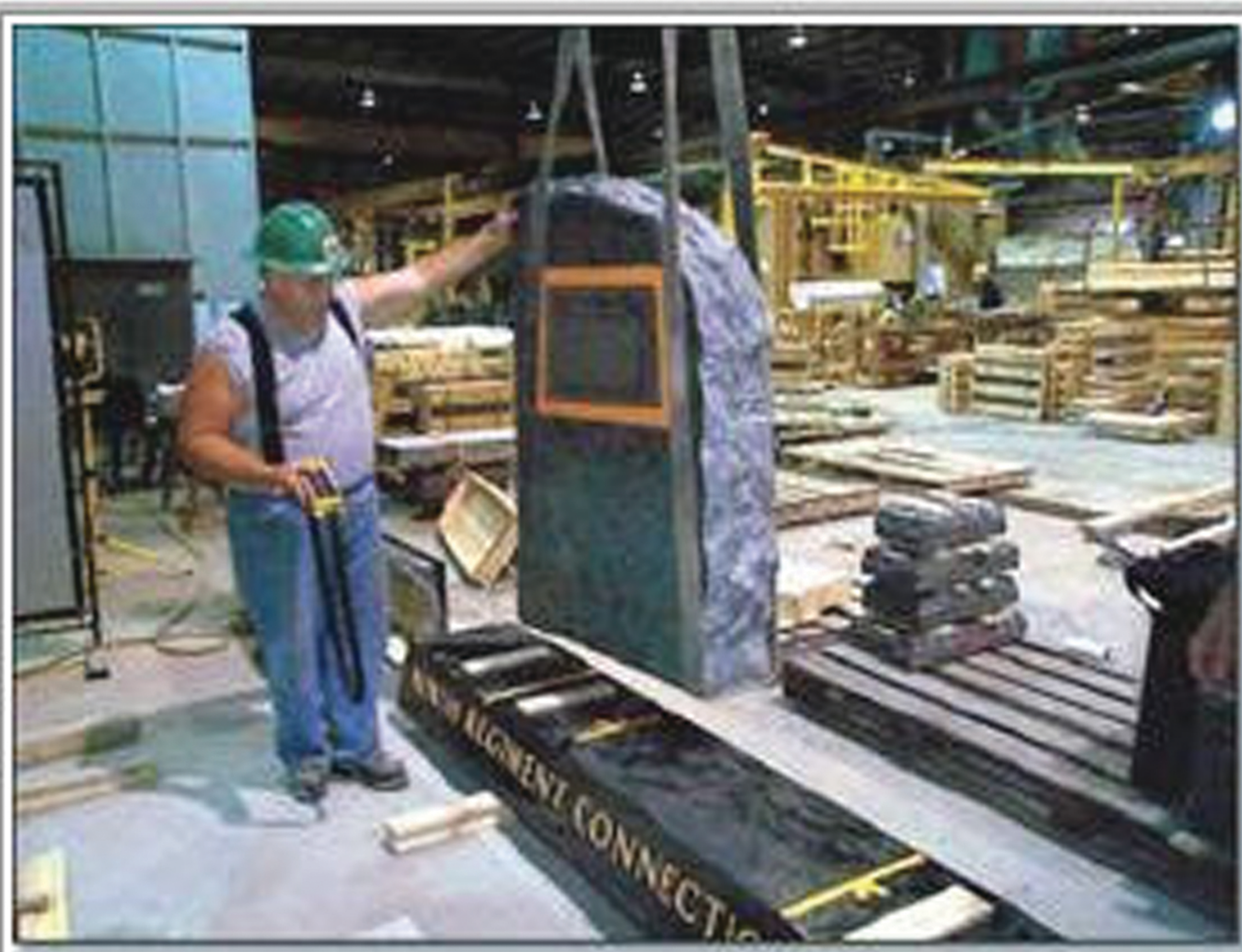
A worker shows part of the Connecticut monument that will be installed at Grant's Canal.