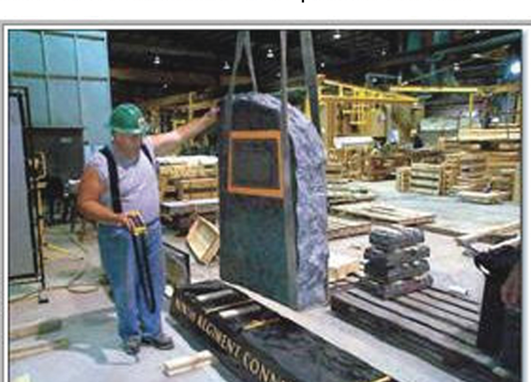
A worker shows part of the Connecticut monument that will be installed at Grant's Canal.